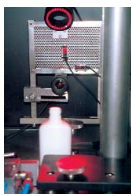
Giramat Vision Orientor

THE GIRAMAT ORIENTOR IS A SIMPLE MACHINE, COMPLETELY RELIABLE, AND AT VERY COMPETITIVE PRICES, AS PROVEN BY THE HUNDREDS OF POSIMAT ORIENTORS WHICH ARE NOW OPERATING IN THE MARKETPLACE.