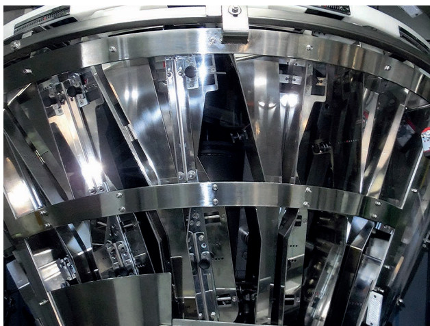
Interior of POSIFLEX-M-15 unscrambler model from ACCESS series

Changeover can be implemented in both machines of our ACCESS series (with cabin) as well as MASTER series (fixed protection).