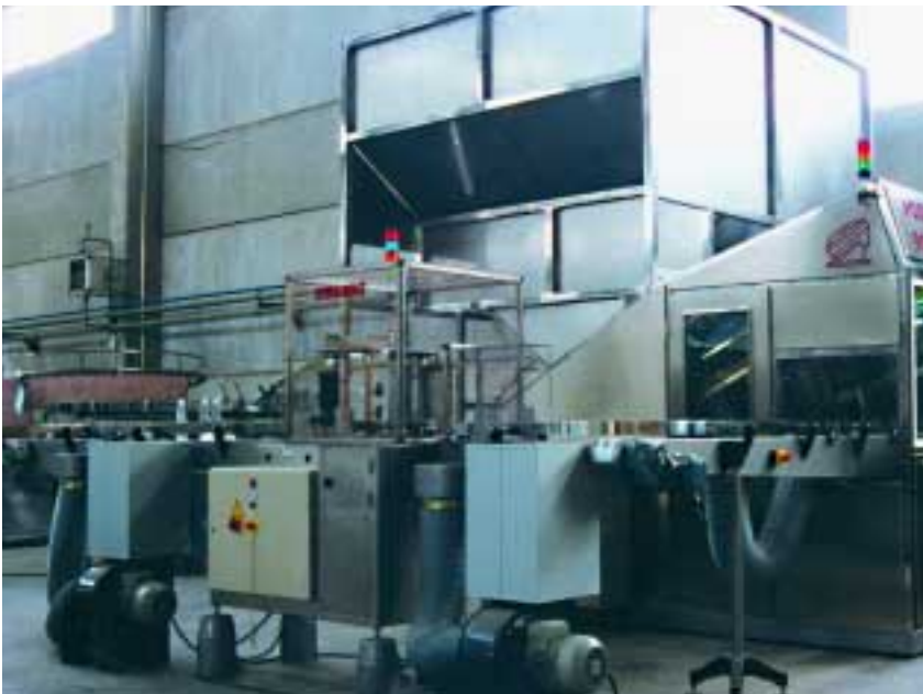
Silo Posisilo, Posimat unscrambler and Giramat orientor

They are adequate for reduced spaces. The Giramat-E exists in the B , D , and Vision versions, which in their standard concept are separate units with their own exit conveyor belt.